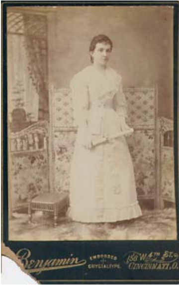
I. Benjamin Portraits 156 W. 4 th St, Cincinnati, O.