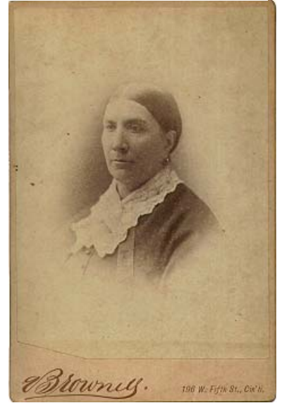
Brownell's (formerly Kelly's) 196 W. Fifth St., Cincinnati, Ohio