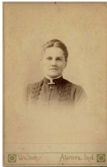
Jas. N. Walton photography No. 90 Second St. Aurora,