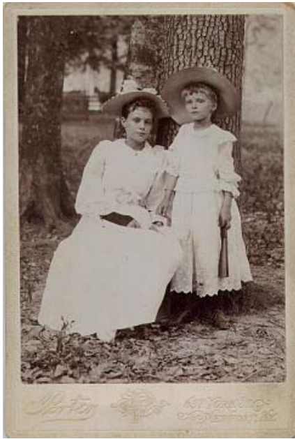
Porter Studio 687 York St. Newport, Ky.